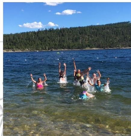
Girls having fun swimming in Lake Como