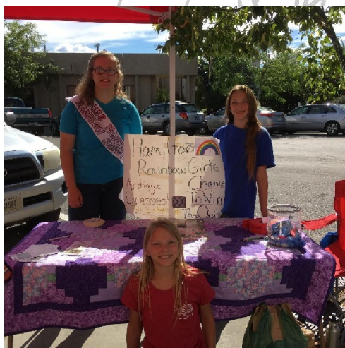
Hamilton girls selling quilt raffle tickets at Daly Days