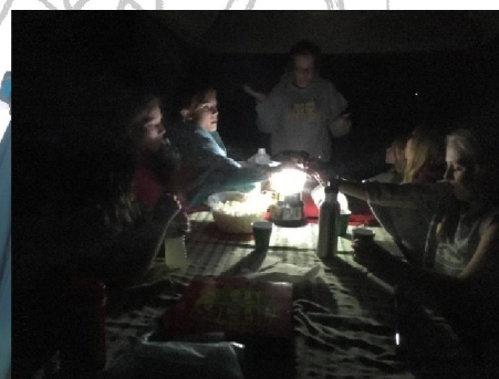
fun & games in the dark at Founder's Day camp out.