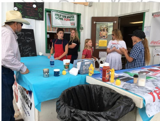
kids working the corn booth at the Missoula Fair