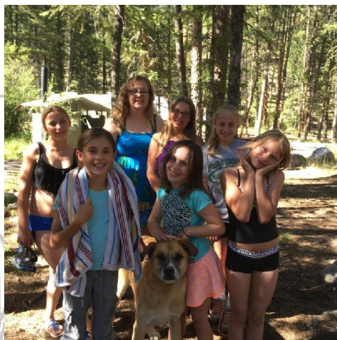
Hamilton & Missoula girls at Lake Como campground