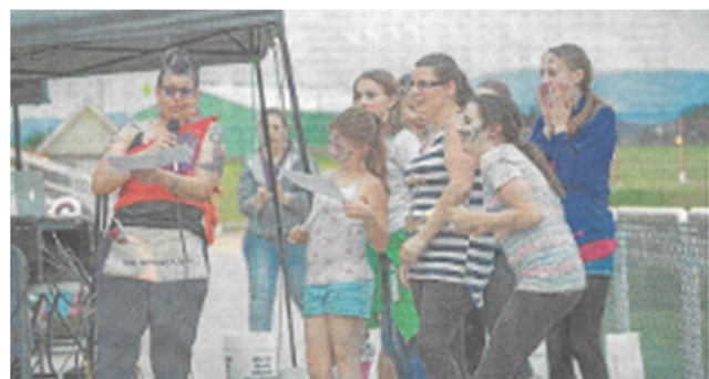
The Helena Assembly #7, International Order of Rainbow for Girls, and Rainbow Pledges react as they receive a certificate of appreciation from the American Cancer Society at Nelson Stadium on Friday.