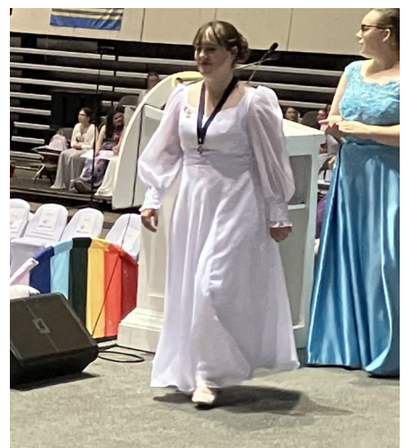
GWA Mikal, & Cavalcade of Flags, introduced in the East.