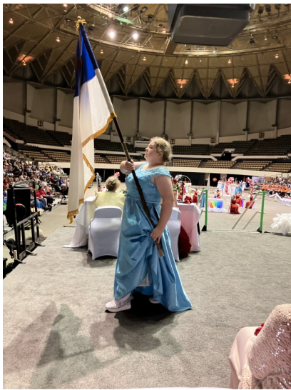
PGWA Tawny, Supreme Page & Flag Bearer.