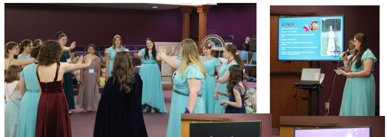
After flag tributes, Grand Representatives gave their reports. One report included a song & dance.