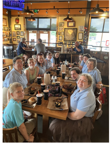
Montana Delegation at Supreme Assembly in Hampton, Virginia.