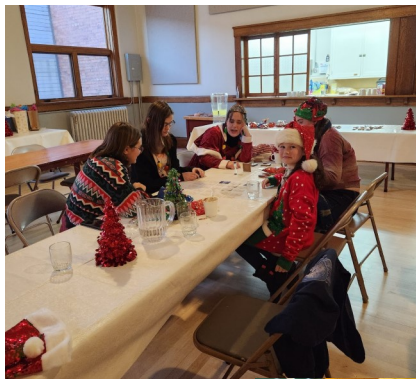
Garden City Assembly #55