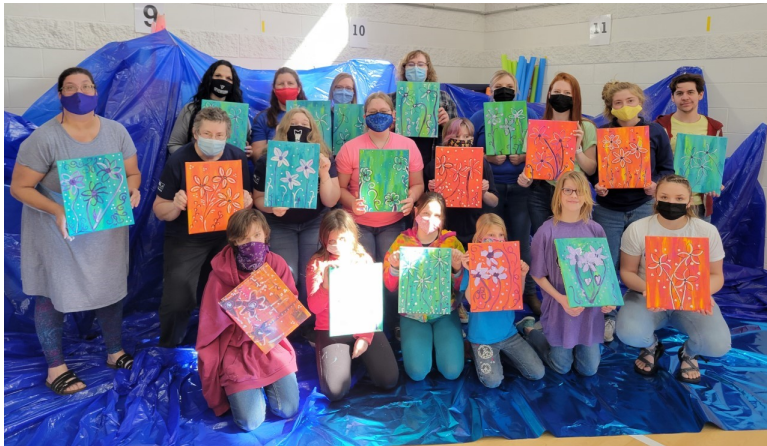
Spring Fling Hardin

We were very excited to see people in person! And had some fun too!